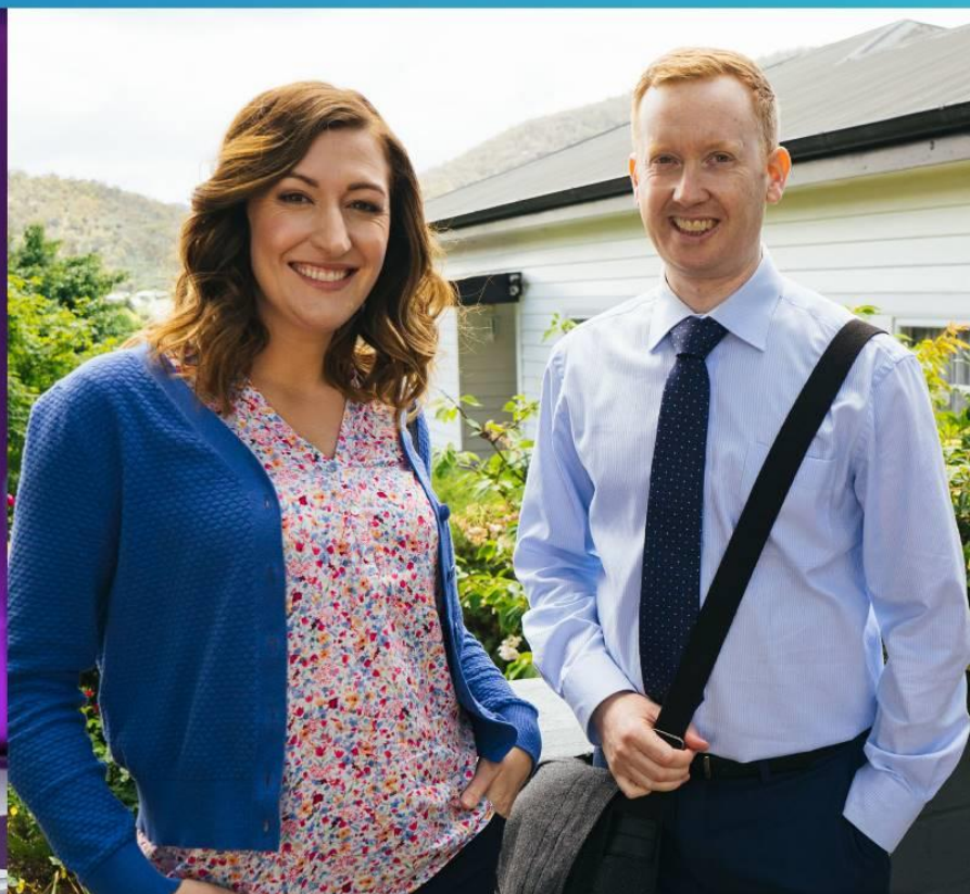
ROSEHAVEN Wednesday 5 August 9.00pm