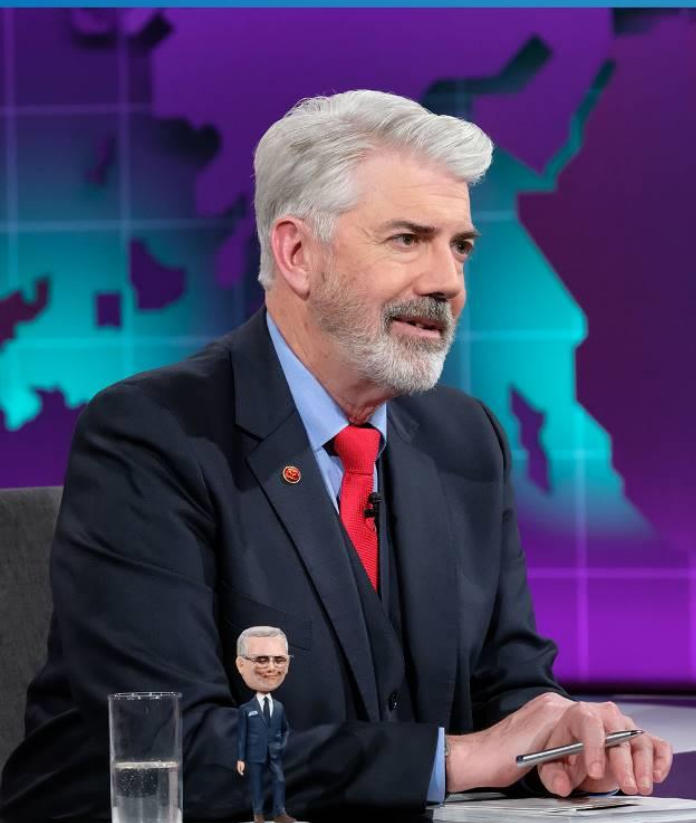
SHAUN MICALLEF'S MAD AS HELL Returns Wednesday 5 August 8.30pm