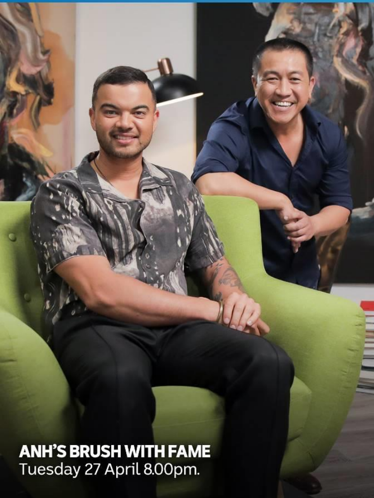
ANH'S BRUSH WITH FAME Tuesday 27 April 8.00pm.