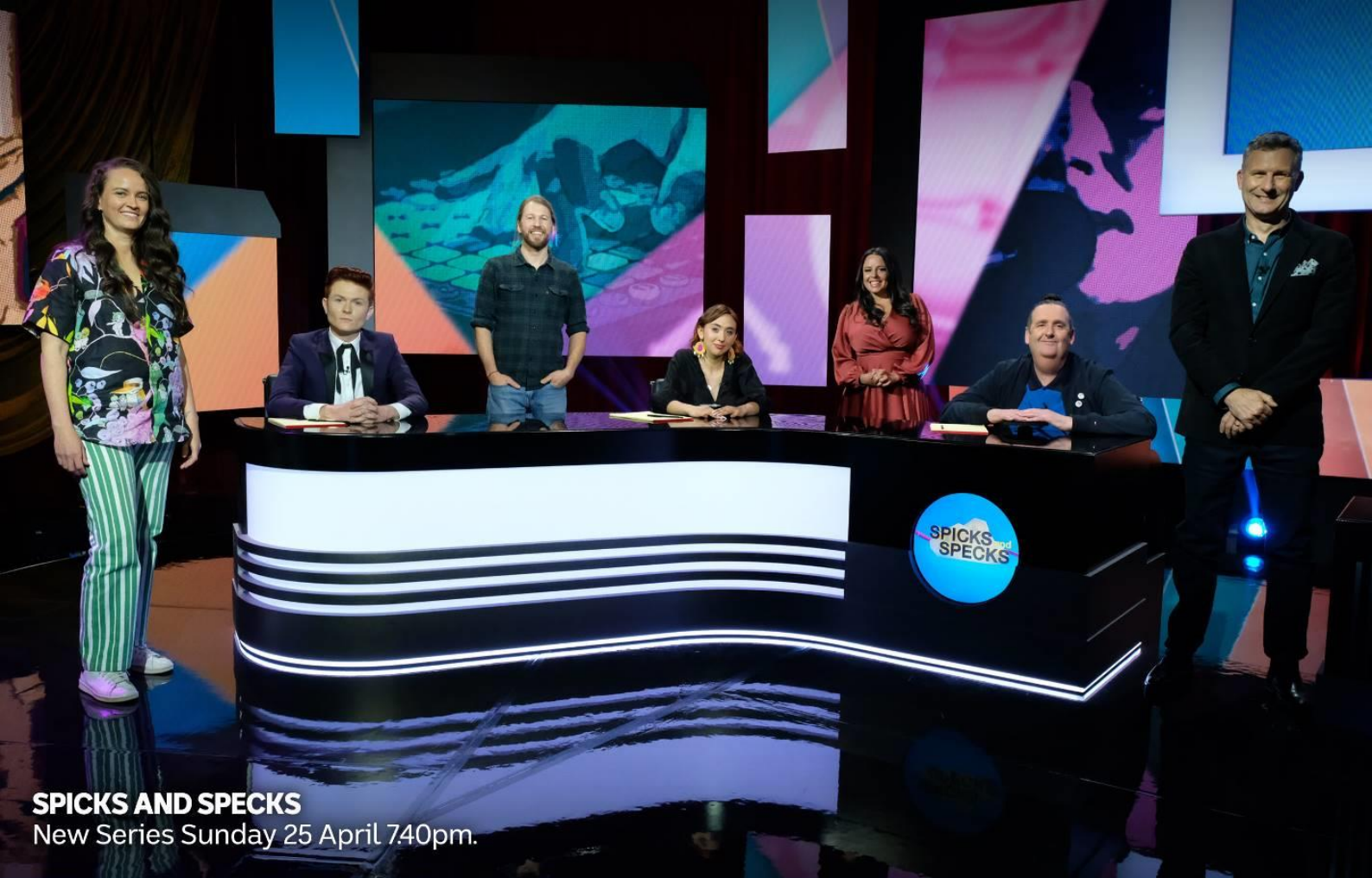
SPICKS AND SPECKS New Series Sunday 25 April 7.40pm.