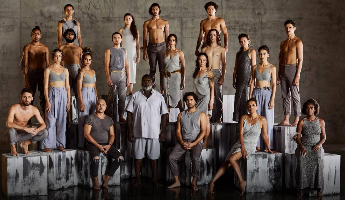
FIRESTARTER: THE STORY OF BANGARRA Tuesday 6 July 8.30pm.