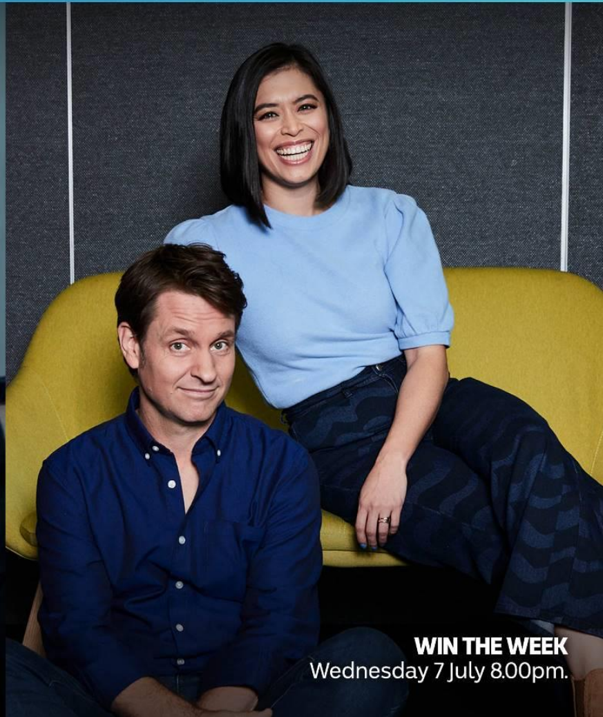
WIN THE WEEK Wednesday 7 July 8.00pm.